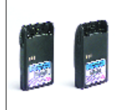
JMNN4023/4024 Slim & Hicap Li-Ion Batteries