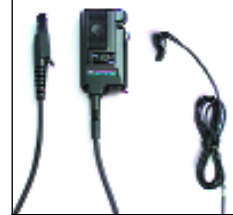
JMMN4064 Ear Mic VOX/PTT Interface Module