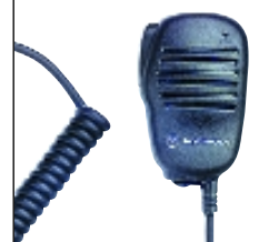
JMMN4067 Remote Speaker Mic