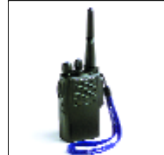
JMZN4020 Radio Wrist Strap

Not pictured: Single Rapid Charger HTN3006 Multi-Unit Rapid Charger TNTN4031A