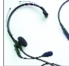
JMMN4066 Light Weight Headset with Boom Mic