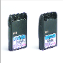
Slim & Hicap Lilon Batteries