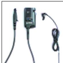
VOX/PTT Interface Module shown with Ear Microphone