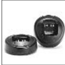
Single Rapid Charger