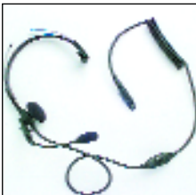
Light Weight Headset