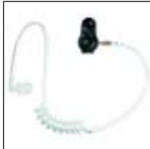
Clear Acoustic Earpiece