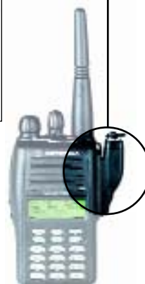
Accessory adaptor to be used with 3.5mm threaded range of audio accessories.