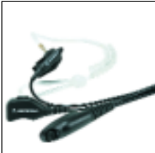
Surveillance Kit with Clear Acoustic Earpiece