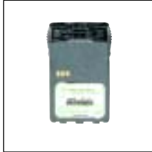
FM NiMH Battery