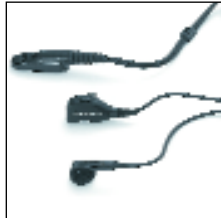
Earbud with Microphone/PTT