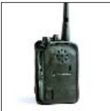
Soft Leather Case with Swivel Clip**