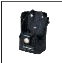
Nylon Case with Swivel Clip**