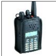
Soft Leather Case with Swivel Clip