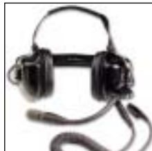
Heavy Duty Headset