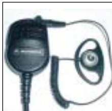
Remote Speaker Microphone with D-Shell Earpiece